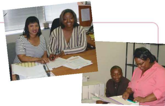
Our team includes members who work on issues related to the home examinations (top) and prepare SISTER STUDY KITS for delivery, carefully checking each one for accuracy (bottom).