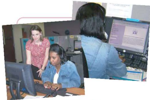
The Sister Study team includes 50 telephone interviewers located in Durham, NC, and Merced, CA, who help sisters complete their 2-part telephone interviews. Some interviewers also answer calls and emails to the Helpdesk and answer calls to help women determine if they are eligible. Here, several of our staff assist a participant by researching a Helpdesk question.

Since 2003 Sister Study staff have worked diligently to enroll eligible sisters, prepare SISTER STUDY KITS, complete telephone interviews, perform home examinations, process laboratory specimens and questionnaires, respond to Helpdesk inquiries, and conduct periodic follow-ups. Below are some snapshots of our team at work.