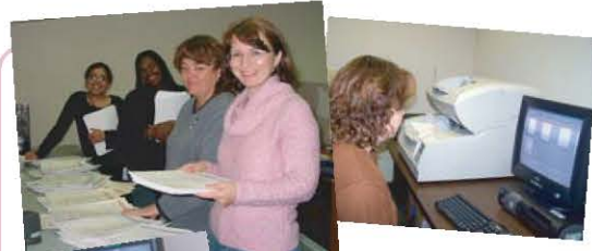
The Sister Study data processing team handles an average of 160 completed questionnaires a day. Questionnaires are reviewed and processed through our scanners, which automatically tabulate and store data.