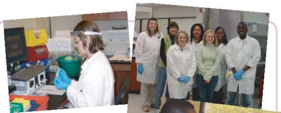
The Sister Study laboratory team currently includes a lab director, a lab supervisor, and 6 biologists. They carefully unpack blood and urine samples as they arrive, dividing tubes of blood into smaller containers. The team also analyzes urine samples for glucose (sugar) reports.