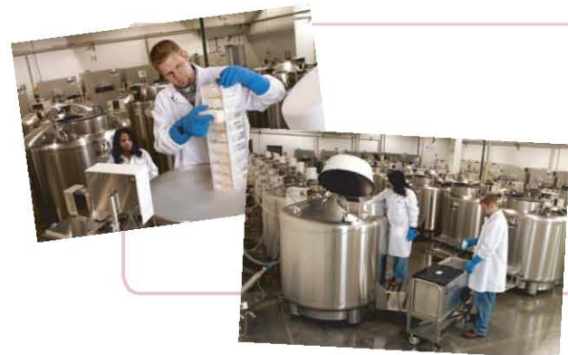
Finally, after processing, blood and urine samples are placed in a central repository for safekeeping.